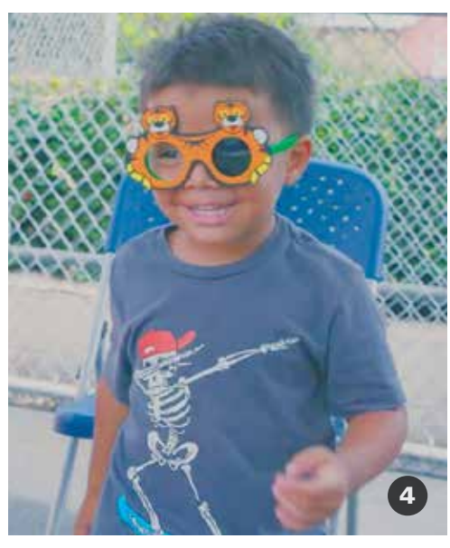
Cedars-Sinai Medical Center