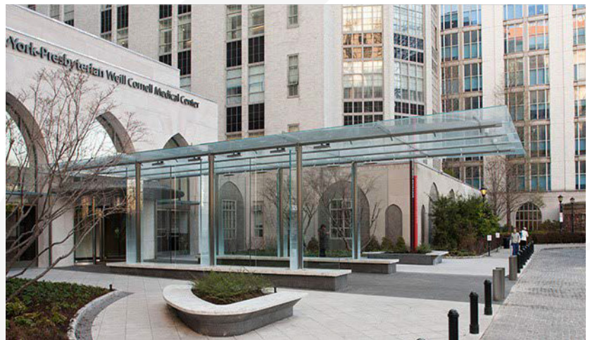
2018 Award Winner

The Excellence in Health Care Facility Management Award is one of the highest honors given by the American Society for Health Care Engineering (ASHE), a professional membership group of the American Hospital Association (AHA). Recipients of the award exemplify how facility managers and caregivers join together to identify an issue and create a proactive and viable approach to it that improves patient care and satisfaction through innovation in facility management operation.